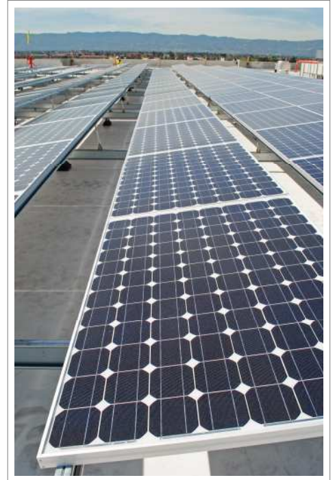
Canadian Solar’s CS5P-240W solar modules are rated among the top modules in PTC efficiency ratings.

San Jose Airport’s investment in clean energy through its solar installation will eliminate the amount of carbon in the environment equivalent to removing 235 passenger vehicles from the road or comparable to the amount of carbon 6,422 trees would sequester annually.