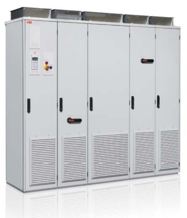
ABB central inverters raise reliability, efficiency and ease of installation to new levels. The inverters are aimed at system integrators and end users who require high performance solar inverters for large photovoltaic power plants and industrial and commercial buildings. The inverters are available from 100 kW up to 630 kW, and are optimized for cost-efficient multimegawatt power plants.