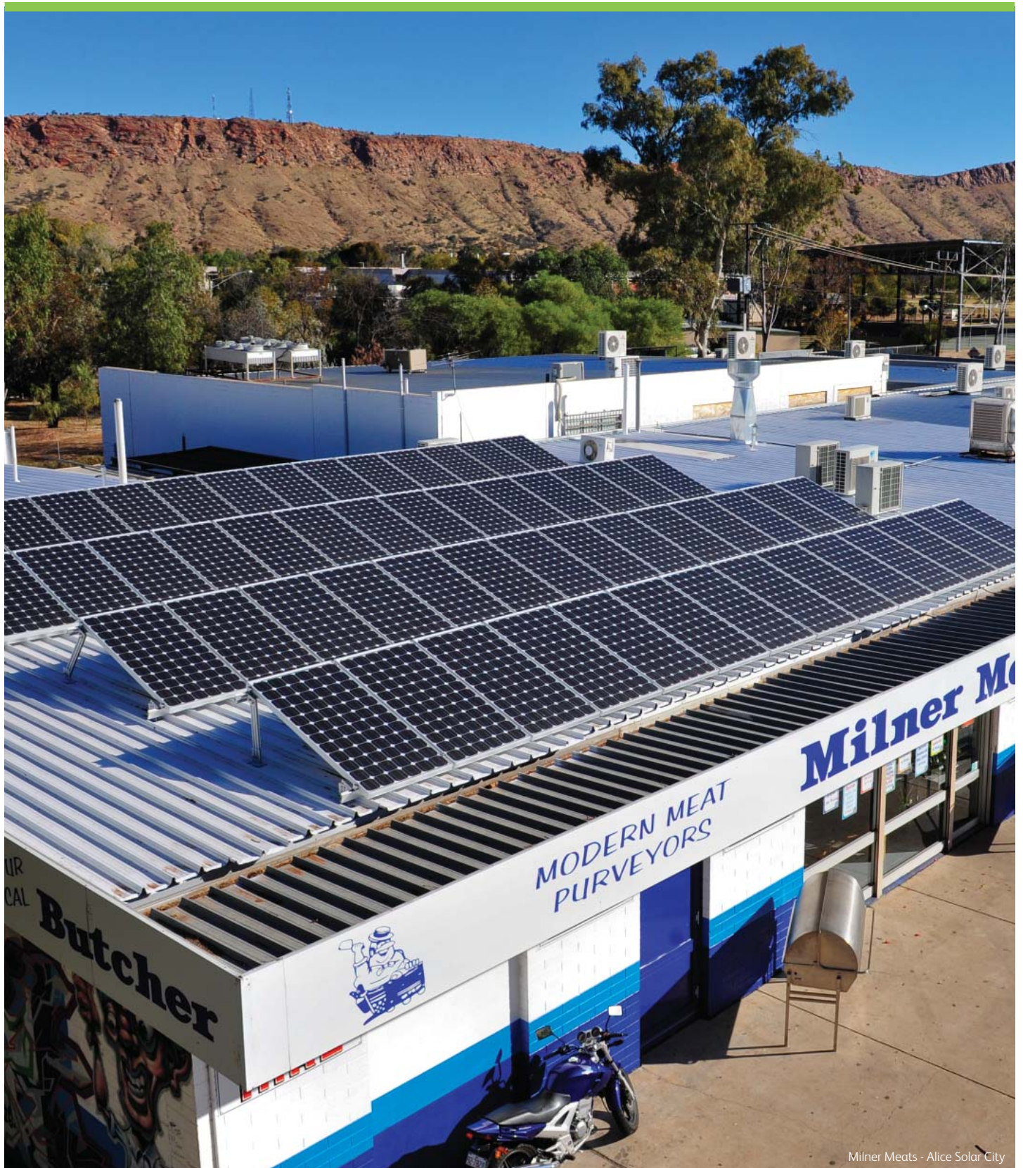
Milner Meats - Alice Solar City