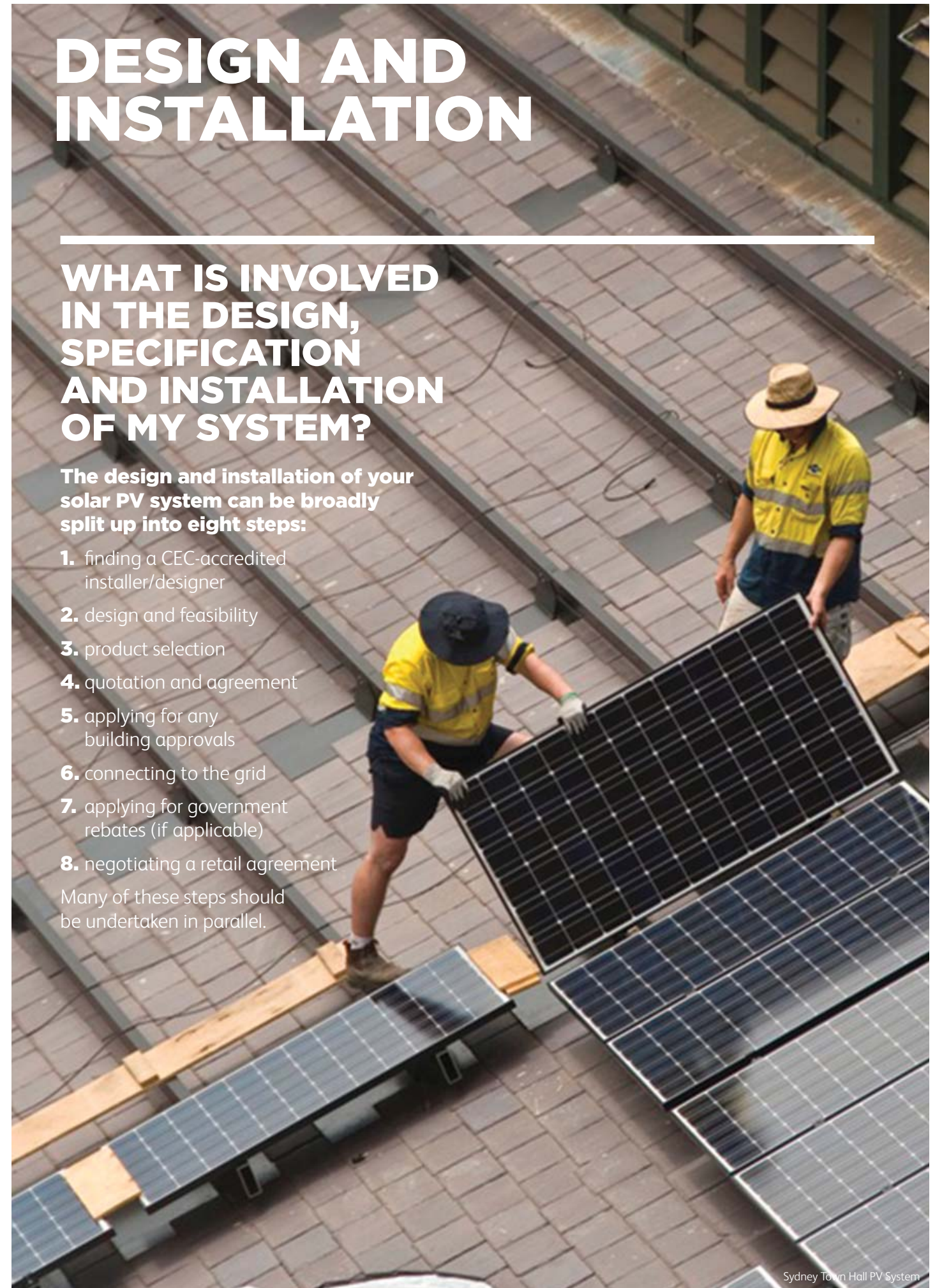
Sydney Town Hall PV System

Many of these steps should be undertaken in parallel.