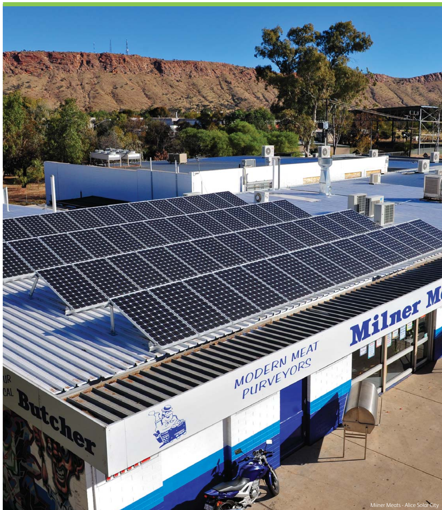
Milner Meats - Alice Solar City