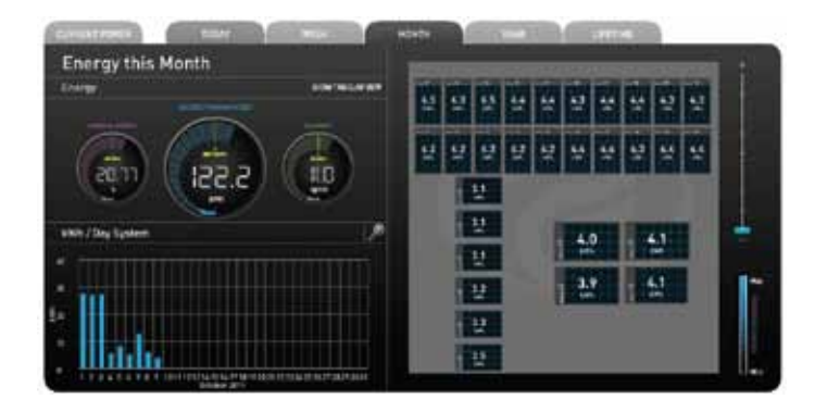
Monitor your system online or via your smart phone app from anywhere in the world.